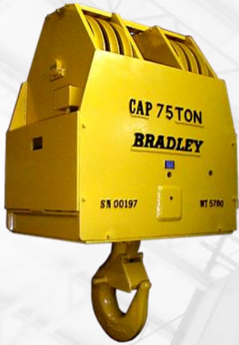
POWER ROTATING HOOK