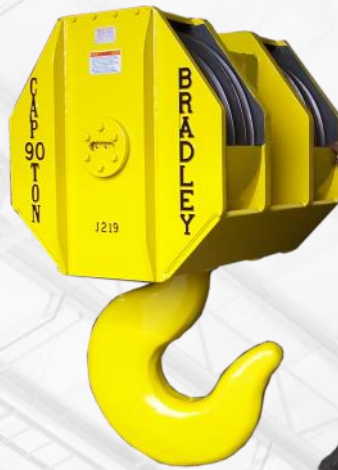
SHEAVE SIZE AND REEVING AVAILABLE FOR ANY HOIST ARRANGEMENT