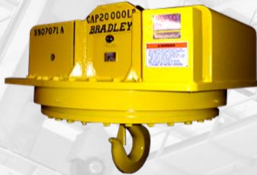
LOW HEADROOM PROFILES CUSTOM REEVING APPLICATION SPECIFIC DESIGNS