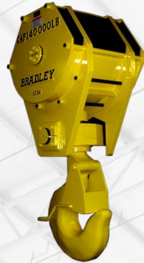
MILL DUTY BOTTOM BLOCK