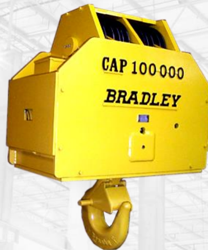
POWERED ROTATING HOOK CAPACITIES TO 500 TONS