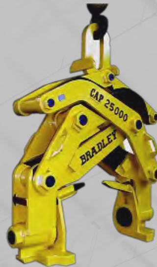
AUTOMATIC INGOT SWIVEL TONG

BRADLEY PROVEN LATCH DESIGN HARDENED WEAR SURFACES WITH REPLACEABLE COMPONENTS