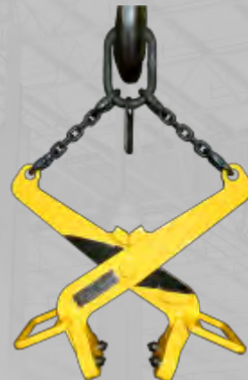
MANUAL BLOCK TONG