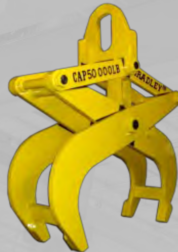
AUTOMATIC DIAMETER TONG