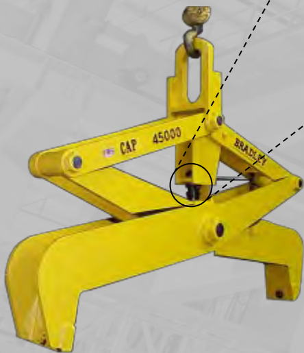
AUTOMATIC 2-POINT TONG