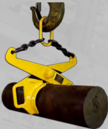
MANUAL ROUND BAR TONG