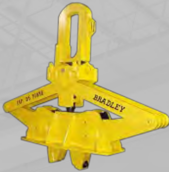
AUTOMATIC INTERNAL TONG