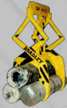
MULTIPLE BILLET TONG