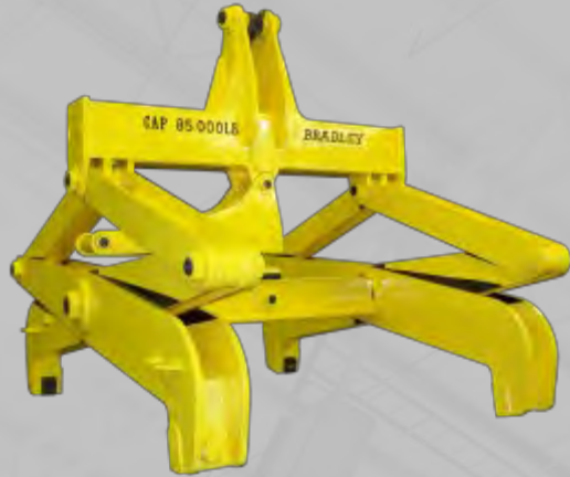
AUTOMATIC 4-JAW INGOT TONG

BRADLEY PROVEN LATCH DESIGN HARDENED WEAR SURFACES WITH REPLACEABLE COMPONENTS