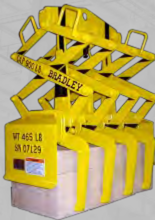
BLOCK BOOKEND TONG