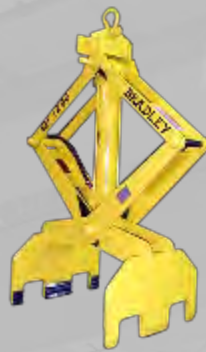
PNEUMATIC BLOCK TONG