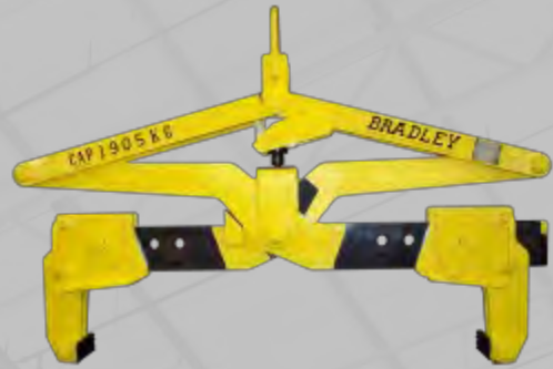
ADJUSTABLE AUTOMATIC 2-JAW TONG