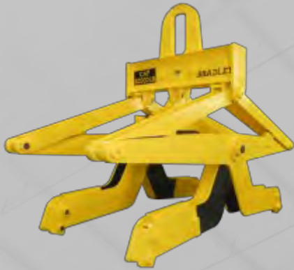
AUTOMATIC 4-JAW SLAB TONG