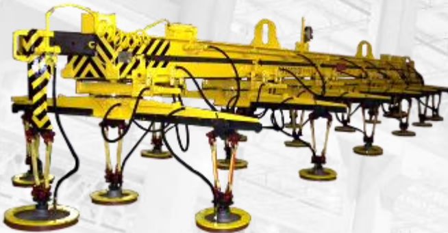
TELESCOPING MULTIPAD VACUUM LIFTING BEAM w/ PIVOTING CROSSARMS