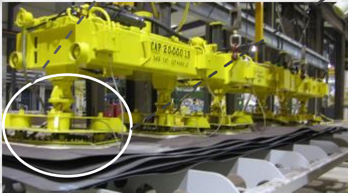
6-PAD VACUUM LIFTING BEAM, HANDLES EXTREME "WAVY" PLATES

4,000# CAPACITY ARTICULATED 33" VACUUM PAD ASSEMBLIES USED TO HANDLE "WAVY" PLATES SEGMENTED INTO 4 QUADRANTS, " FLEX" W/LOAD TO HELP ELIMINATE "PEEL-OFF"