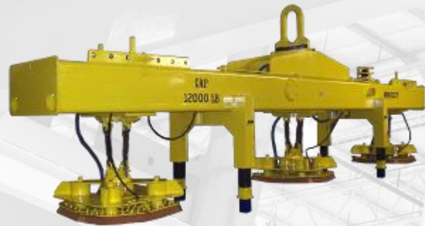
3-PAD ADJUSTABLE VACUUM LIFTING BEAM w/ BUILT-IN STAND & STEPPER SWITCH