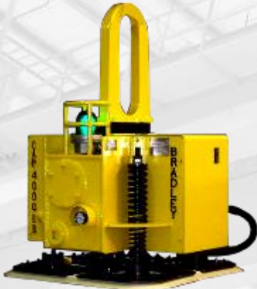
SINGLE 33" VACUUM LIFTER INCLUDES VACUUM POWER SUPPLY