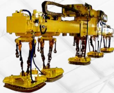
TELESCOPING MULTI-VACUUM PAD LIFTER, w/ARTICULATED 33" VACUUM PADS