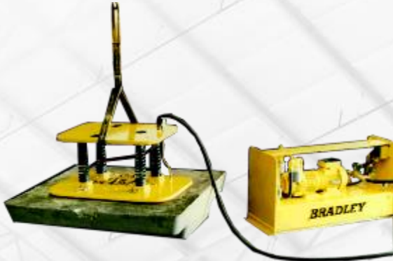
VACUUM OPERATED PIG INGOT PULLER