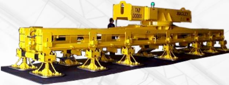
30' LONG VACUUM LIFTING BEAM w/ BUILT-IN POWER ROTATE