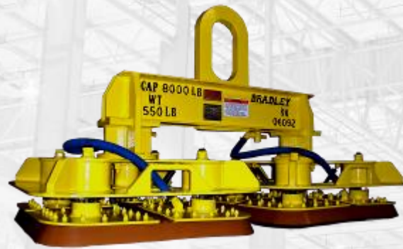
DOUBLE 33" VACUUM PADS 8000# CAPACITY