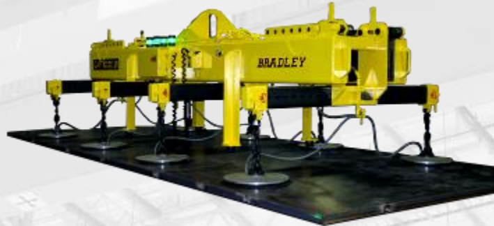
ADJUSTABLE MULTIPAD VACUUM LIFTER