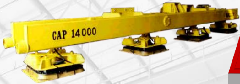
4-PAD VACUUM LIFTING BEAM