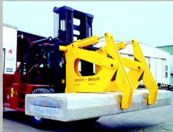
HYDRAULIC INGOT GRAB FOR MOBILE LIFT TRUCK