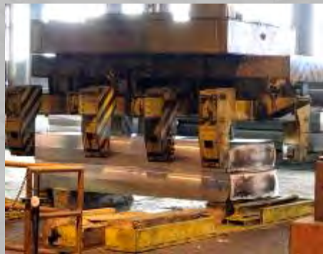
MOTOR DRIVEN 8-JAW INGOT TRANSFER SYSTEM