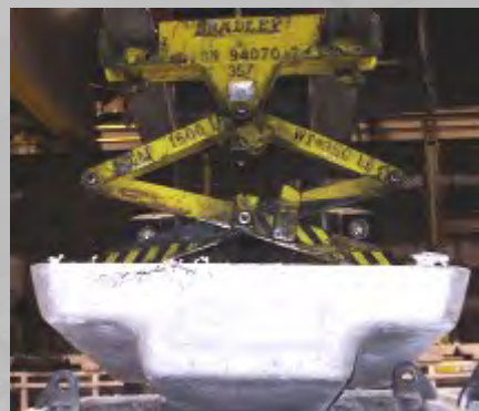
AUTOMATIC PIG INGOT TONG