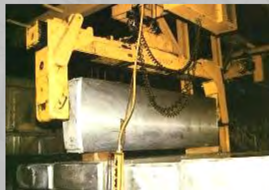
END GRIP INGOT ROLLOVER GRAB w/POWER SWIVEL JAW