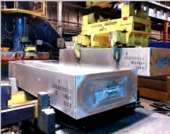
HORIZONTAL INGOT GRAB