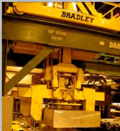
INGOT TRANSFER SYSTEM w/HORIZONTAL INGOT GRAB