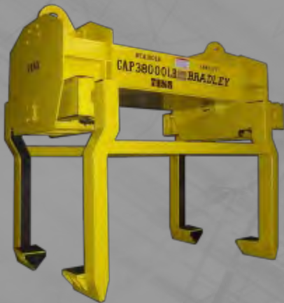
MOTORIZED 4-LEG HORIZONTAL INGOT LIFTER