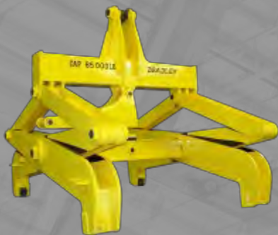
AUTOMATIC 4-JAW HORIZONTAL INGOT TONG