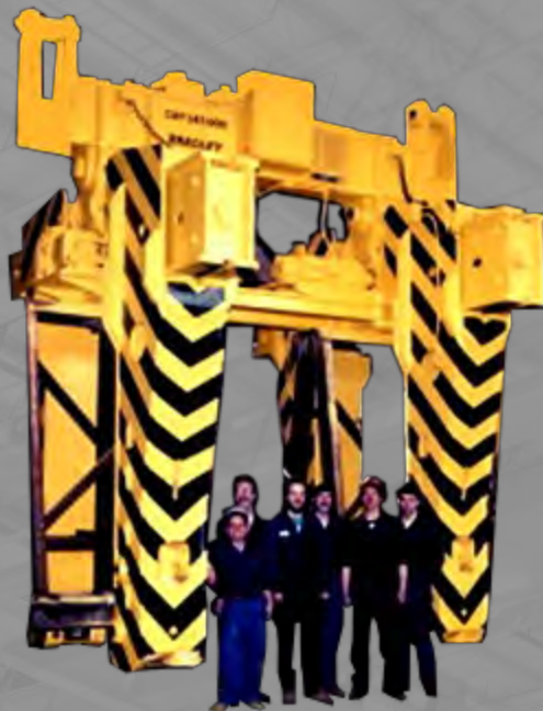
MOTOR DRIVEN 4-JAW INGOT STACK GRAB