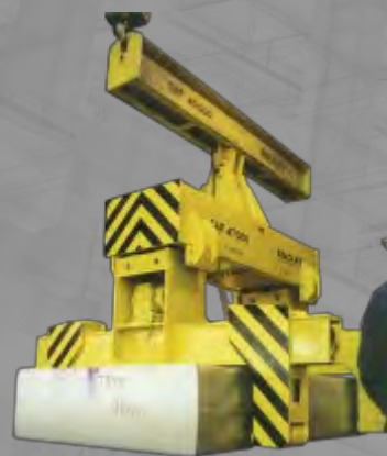
MOTORIZED 4-JAW INGOT GRAB