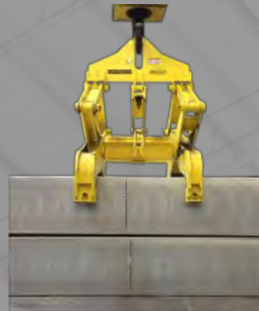
AUTOMATIC 4-JAW INGOT TONG