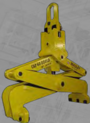
AUTOMATIC SINGLE TONG FOR HORIZONTAL INGOTS