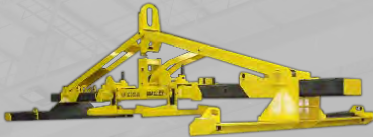
ADJUSTABLE AUTOMATIC LOG BUNDLE GRAB