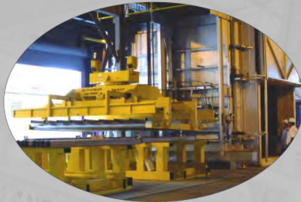
PREPARING FURNACE LOAD USING BILLET & SPACER GRAB