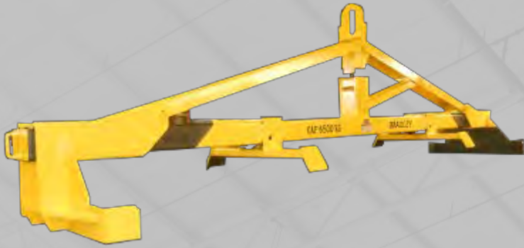
AUTOMATIC BILLET ROW GRAB