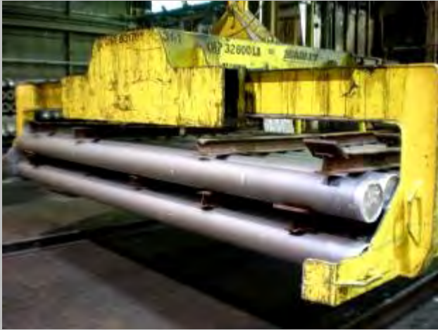
TRANSPORT TWO ROWS OF BILLETS