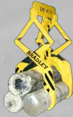
AUTOMATIC TRIPLE INGOT TONG