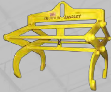
AUTOMATIC DIAMETER TONG