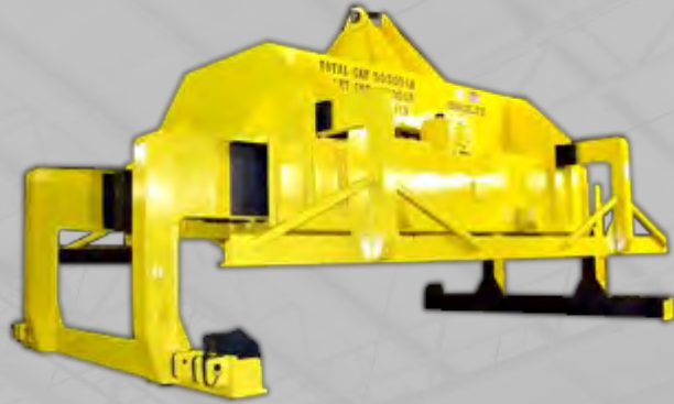
MOTORIZED BILLET & SPACER GRAB