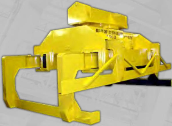
MOTORIZED BILLET & SPACER GRAB WITH INTEGRAL POWERED ROTATE