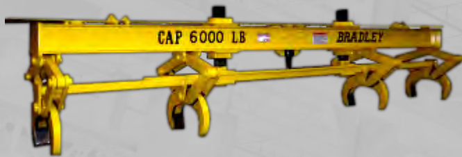
AUTOMATIC DIAMETER TONG