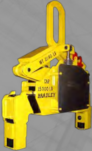
GEARED LEVER ARM TONG w/ SAFETY LOCKING CYLINDER