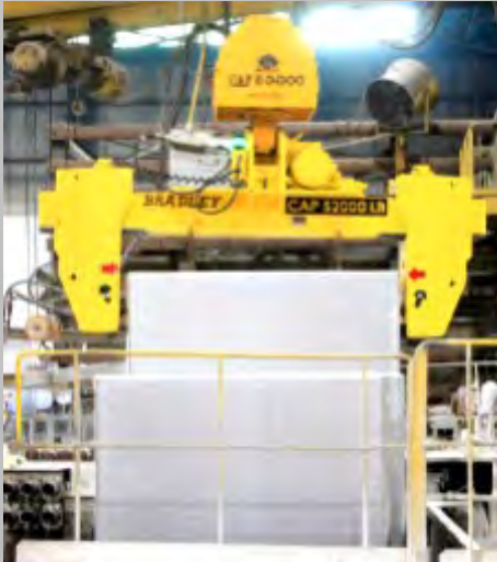
MOTORIZED INGOT SWIVEL GRAB