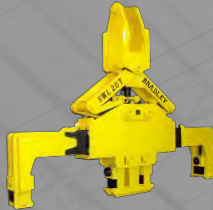
DOUBLE T - INGOT SWIVEL TONG