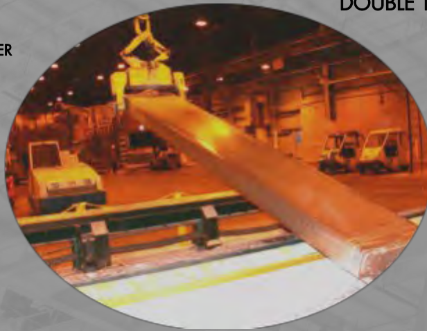
DOWNENDING T-INGOT TONG