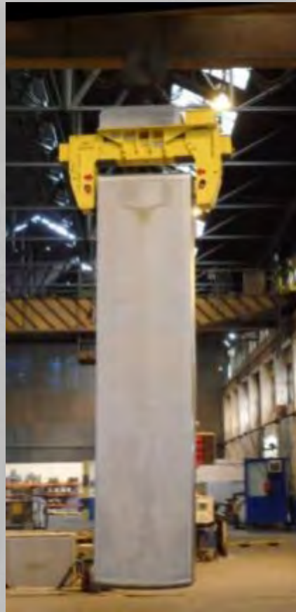
TRANSPORT INGOT VERTICALLY AND LAY DOWN TO HORIZONTAL POSITION