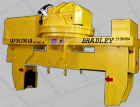
MOTORIZED INGOT SWIVEL GRAB w/ INTEGRAL POWER ROTATE