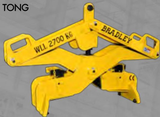
INGOT STUB REMOVAL TONG